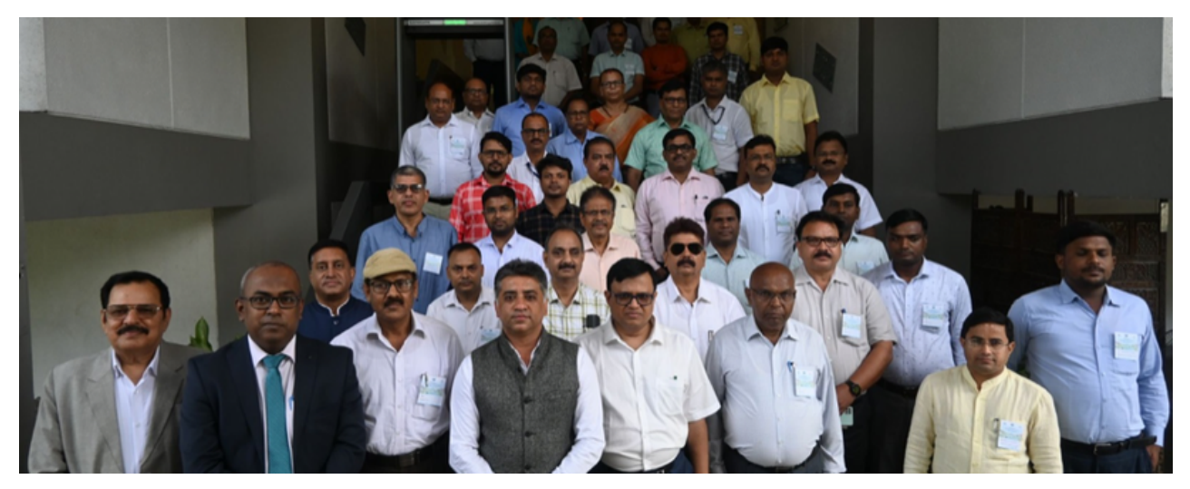
Group picture of officials from State

During the training, six more cities, Araria, Samastipur, Siwan, Supaul, Kishanganj and Hajipur, were officially onboarded into the River Cities Alliance