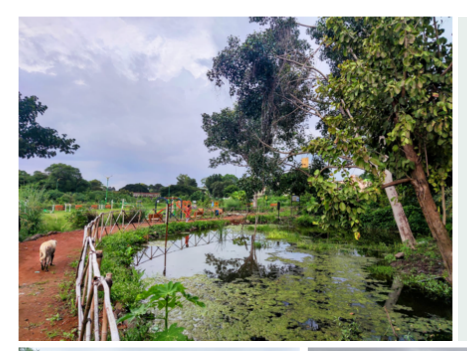
Restoring the groundwater fed natural springs/water bodies riparian buffer and wells in the flood plains to enhance the baseflow