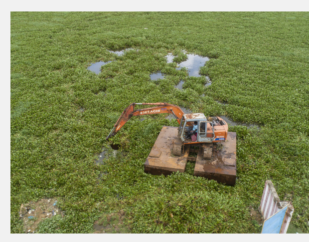
Weed removal at Sembakkam Lake

The Sembakkam lake restoration project in Chennai is being carried out by TNC-India. The project is distinguished in its way of scientific approach where essential baseline surveys including on watersheds, hydrology, biodiversity and community survey conducted informed the restoration plan for the wetland. Key steps include - silt removal thus carrying capacity, strengthening improving the embankments, eco-friendly landscape for the community connectivity and improvement of biodiversity habitat, creation of constructed wetlands, strong stakeholder long-term monitoring, evaluation maintenance and Internet of Things (IoT) based lake water quality monitoring system.